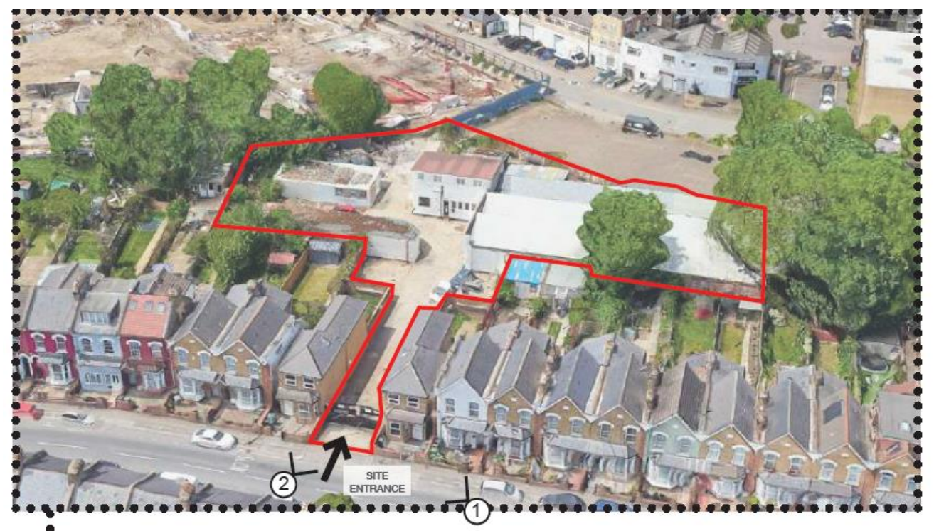
Fig 1: site location in context