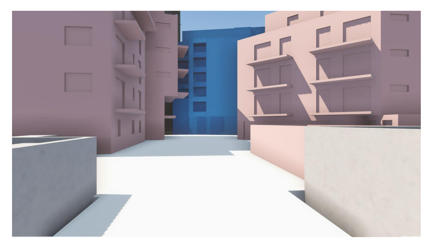
View from the sites entrance