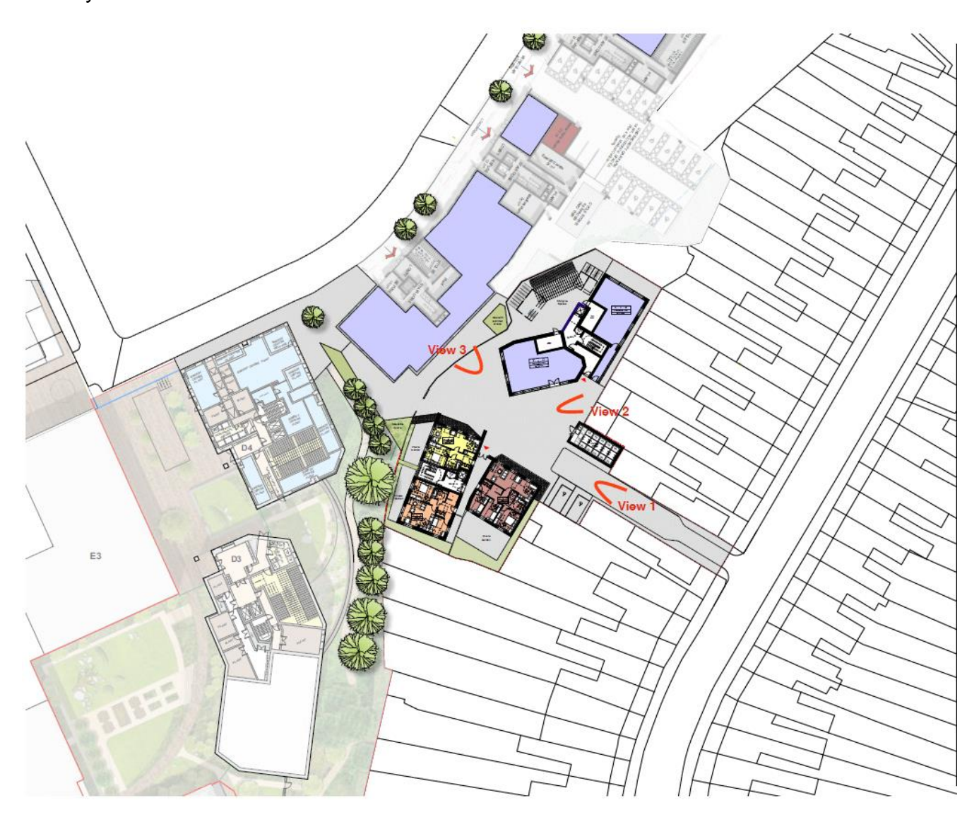
View from the sites boundary